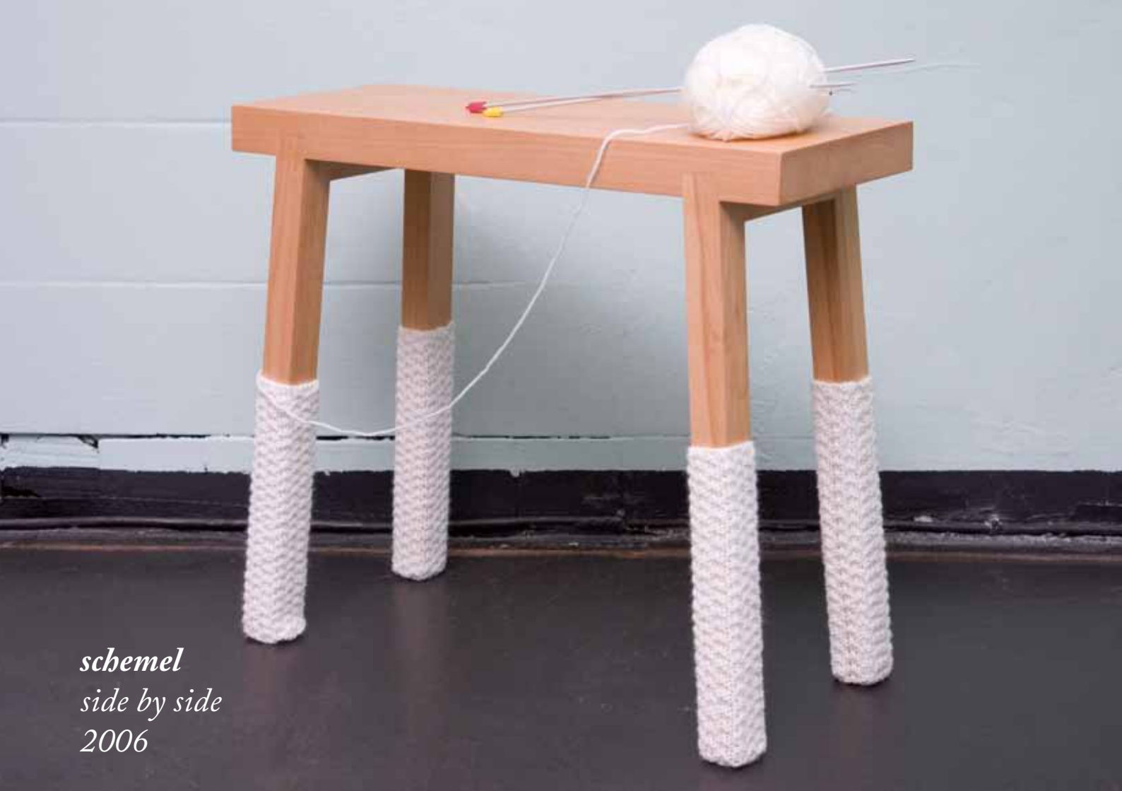
schemel side by side 2006