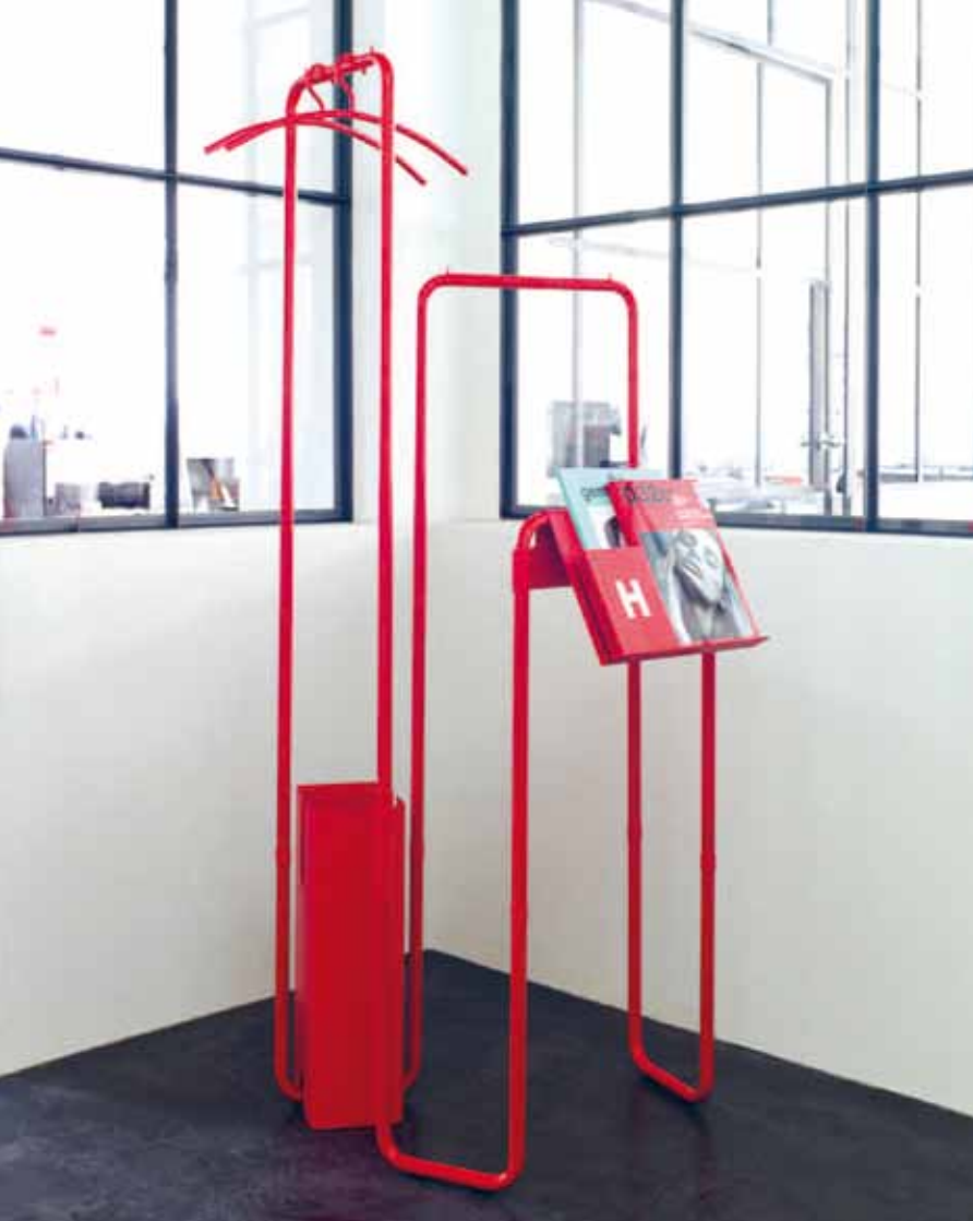
spin schönbuch. 2010